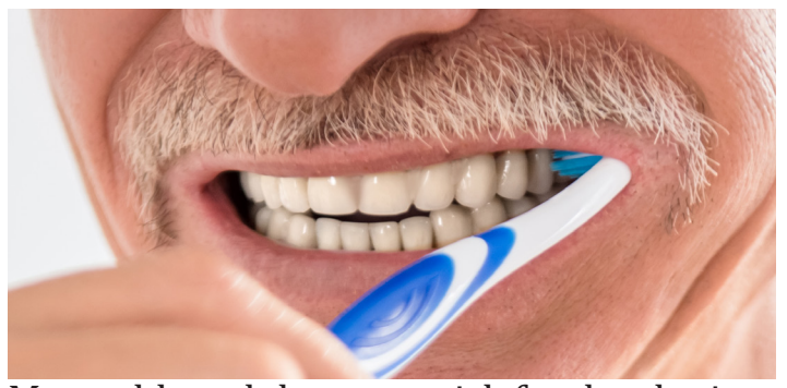
Many older adults are at risk for developing additional chronic conditions if preventive measures are not taken.

Considerations: According to the National Council on Aging, approximately 77% of older adults have at least two chronic diseases. The majority of deaths related to chronic diseases are caused by heart disease, cancer, stroke, and diabetes.<sup>3</sup> The high rates of chronic disease in this population mean a significant cost for the health care system.