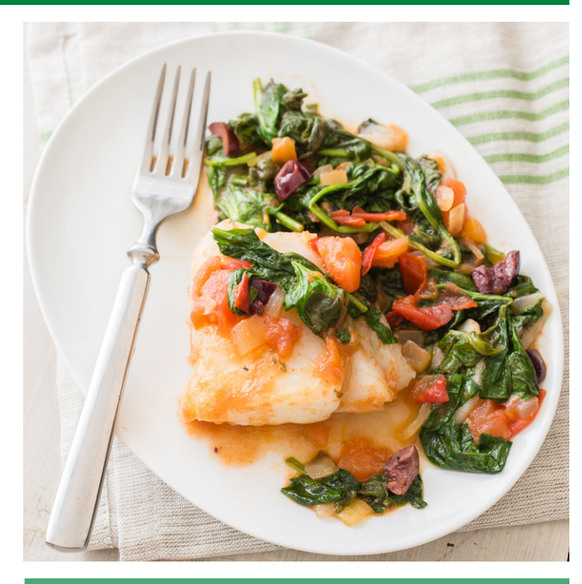
NUTRIENTS PER SERVING: Calories 196, Protein 25 g, Dietary Fiber 6 g, Total Fat 6 g, Saturated Fat 1 g, Cholesterol 47 mg, Sodium 255 mg