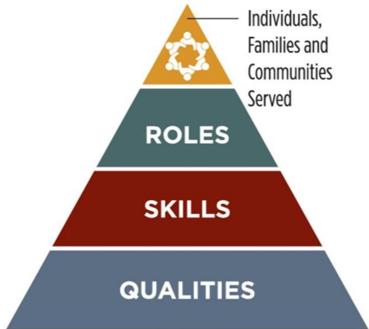
Figure 1: The CHWs Roles and Competencies Support Pyramid